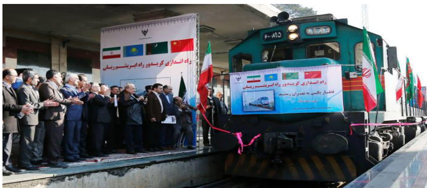
Image: China-Kazakhstan-Turkmenistan-Iran Rail Project

China is the major investor and largest trade partner with Tajikistan. It has constructed new highways to connect Xinjiang with its neighboring Central states. With the help of China, electrification process of railway lines is underway in Uzbekistan. China has also constructed a tunnel between Ahangaran and Pop in Uzbekistan. This tunnel has reduced hundreds of kilometers of journey between the two cities. 22 China-Kazakhstan-Turkmenistan-Iran railway line is operational. In January 2016, first Chinese cargo train went to Iran through this railway line. This journey was completed in only 16 days which had to take almost double time through the sea route. 23