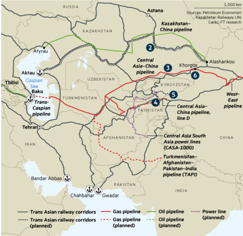
Image: Central Asian Roads, Rails and Energy Transportation Network